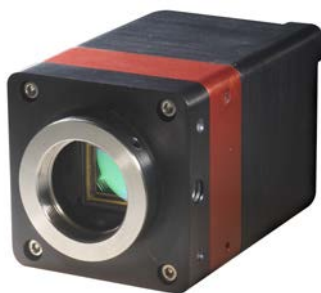
Figure 2: Owl 320 and 640 InGaAS cameras