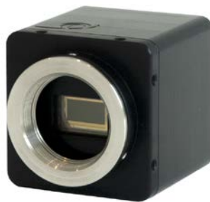
Figure 1: Cygnet CMOS camera